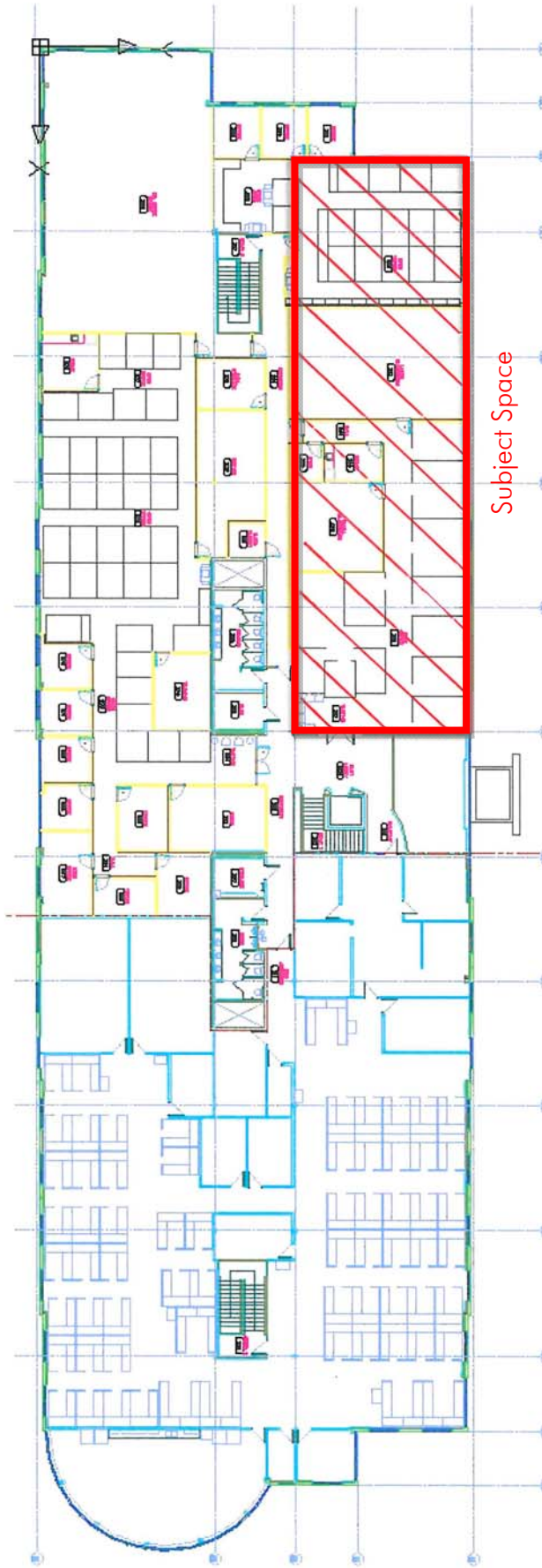
Iron Bridge Building II 2 nd Floor 611 N. Perry